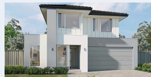
Contemporary Double Storey

*Disclaimer: All photos and illustrations are representative and are to be used as a guide only. Images may depict features such as landscaping, fencing, driveway, timber decking, furniture, window furnishings and lighting which are not included in the base price or which are not available from Sherridon Homes. Floorplans and specifications may be varied by Sherridon Homes without notice, the dimensions are diagrammatic only. The Building Contract with final drawings will display the final dimensions and detail. All information provided is for information purposes only and does not constitute a legal contract between Sherridon Homes and any person or entity. This information is subject to change without prior notice. Facades shown are a style only and may differ depending on the house type chosen. Facades are subject to change depending on the developers, council and other authority requirements. Upgrade facades require 2590mm ceilings height. Minimum lot size guidance is subject to orientation, land characteristics, developer and Council requirements. All designs are the property of Sherridon Homes and must not be used, reproduced, copied or varied, wholly or in part without written permission from an authorised Sherridon Homes representative. Copyright Sherridon Homes.