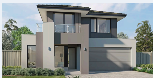
Coastal Double Storey