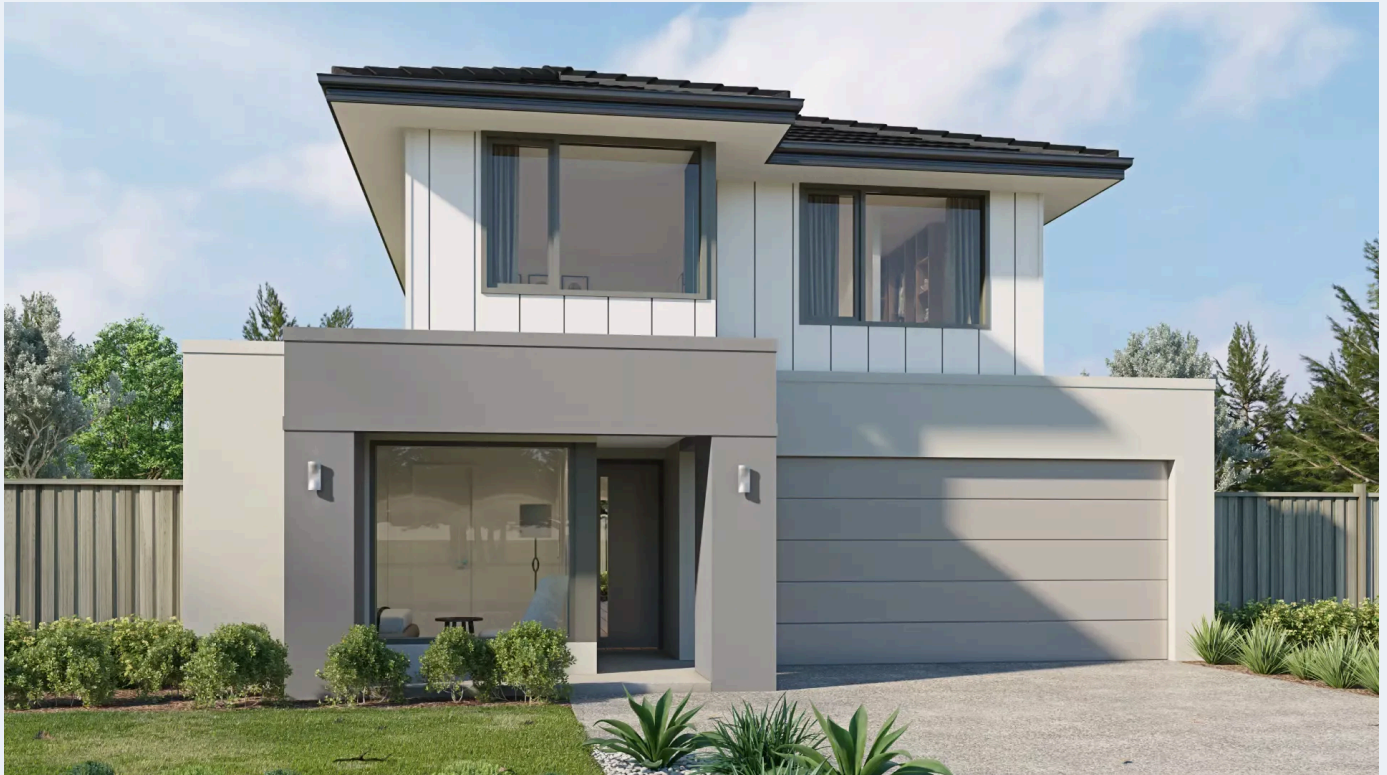
Modern Double Storey