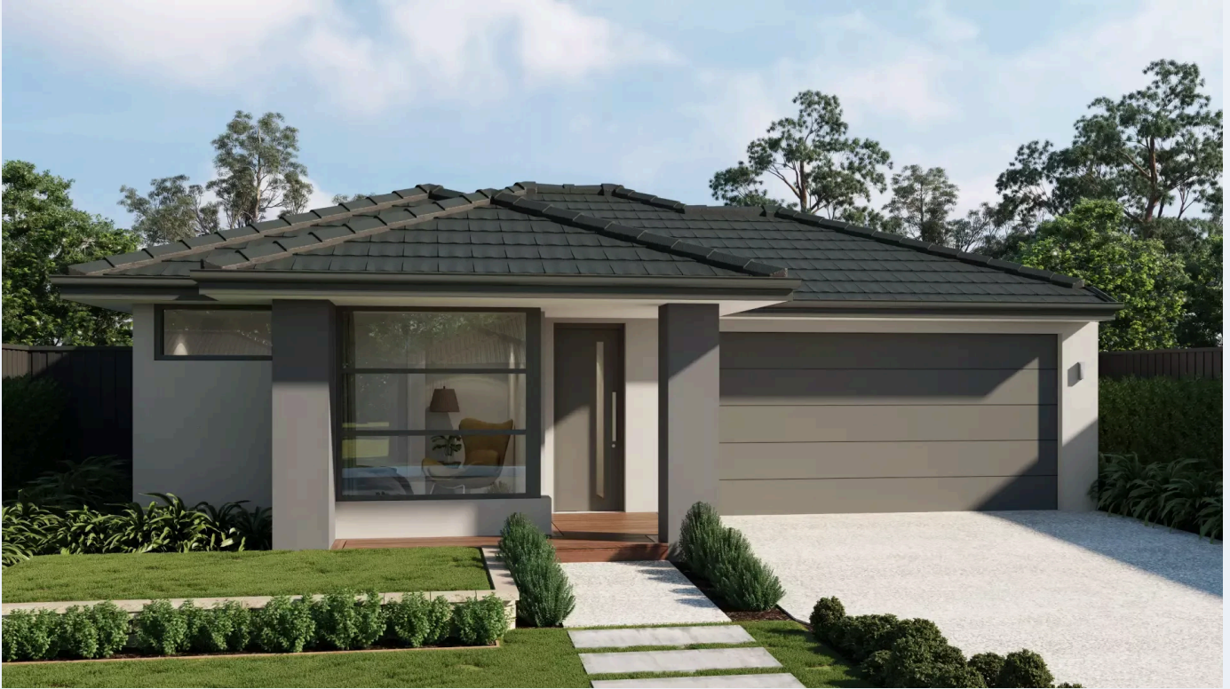
Modern Double Garage