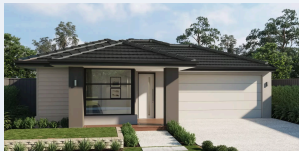
Coastal Double Garage