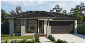
Contemporary Double Garage