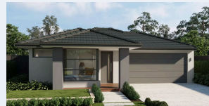
Modern Double Garage

*Disclaimer: All photos and illustrations are representative and are to be used as a guide only. Images may depict features such as landscaping, fencing, driveway, timber decking, furniture, window furnishings and lighting which are not included in the base price or which are not available from Sherridon Homes. Floorplans and specifications may be varied by Sherridon Homes without notice, the dimensions are diagrammatic only. The Building Contract with final drawings will display the final dimensions and detail. All information provided is for information purposes only and does not constitute a legal contract between Sherridon Homes and any person or entity. This information is subject to change without prior notice. Facades shown are a style only and may differ depending on the house type chosen. Facades are subject to change depending on the developers, council and other authority requirements. Upgrade facades require 2590mm ceilings height. Minimum lot size guidance is subject to orientation, land characteristics, developer and Council requirements. All designs are the property of Sherridon Homes and must not be used, reproduced, copied or varied, wholly or in part without written permission from an authorised Sherridon Homes representative. Copyright Sherridon Homes.