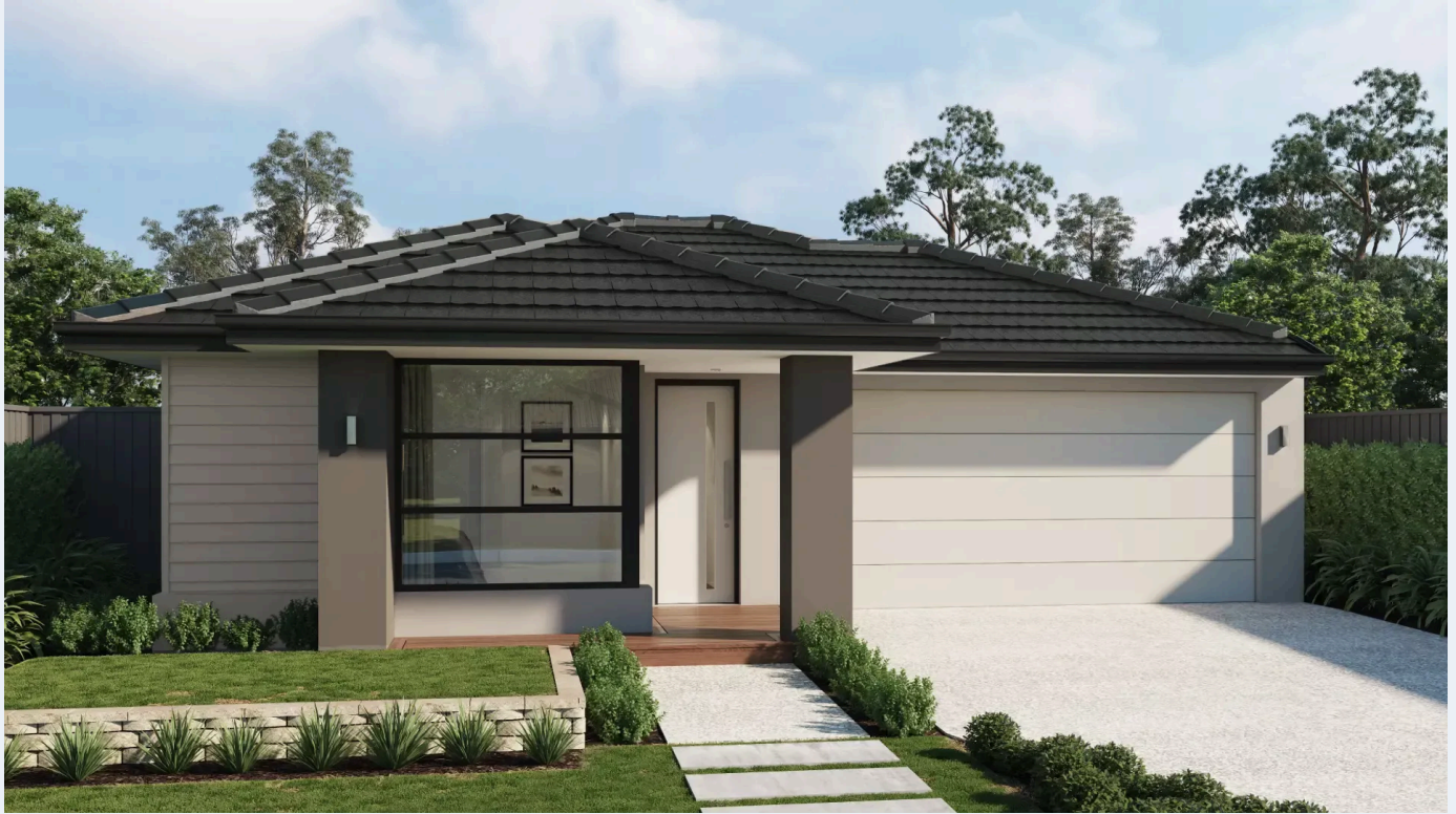
Coastal Double Garage