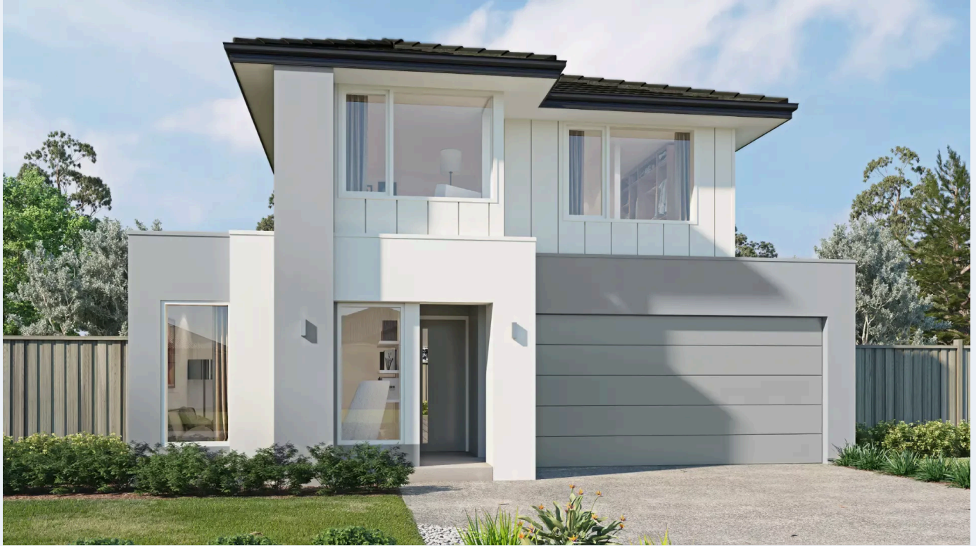
Contemporary Double Storey