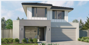
Modern Double Storey