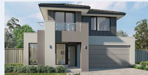
Coastal Double Storey

*Disclaimer: All photos and illustrations are representative and are to be used as a guide only. Images may depict features such as landscaping, fencing, driveway, timber decking, furniture, window furnishings and lighting which are not included in the base price or which are not available from Sherridon Homes. Floorplans and specifications may be varied by Sherridon Homes without notice, the dimensions are diagrammatic only. The Building Contract with final drawings will display the final dimensions and detail. All information provided is for information purposes only and does not constitute a legal contract between Sherridon Homes and any person or entity. This information is subject to change without prior notice. Facades shown are a style only and may differ depending on the house type chosen. Facades are subject to change depending on the developers, council and other authority requirements. Upgrade facades require 2590mm ceilings height. Minimum lot size guidance is subject to orientation, land characteristics, developer and Council requirements. All designs are the property of Sherridon Homes and must not be used, reproduced, copied or varied, wholly or in part without written permission from an authorised Sherridon Homes representative. Copyright Sherridon Homes.